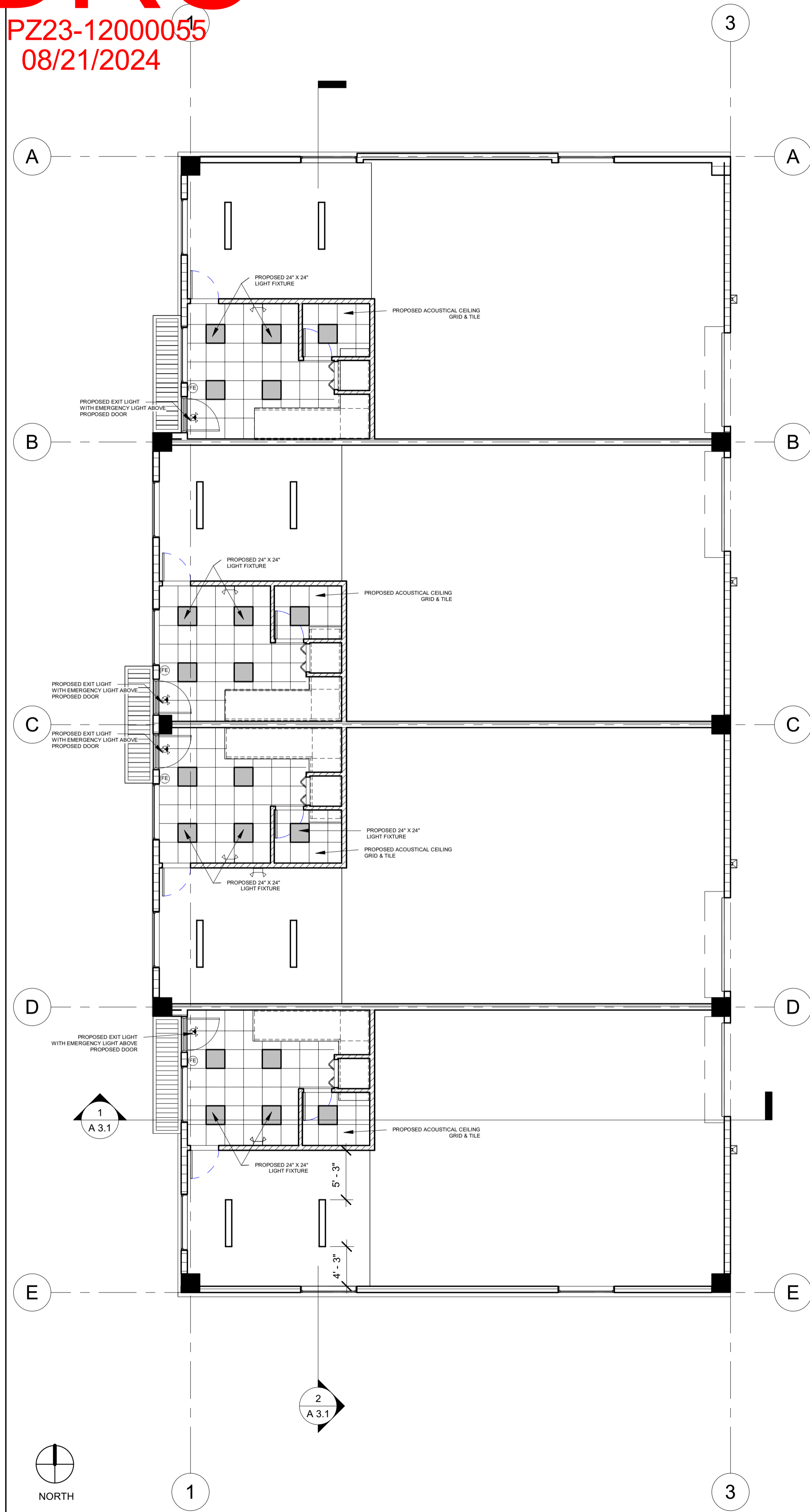
1 1ST FLOOR 1/8" = 1'-0" (7.51' NAVD)

1 PROPOSED FIRST FLOOR REFLECTED CEILING PLAN